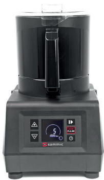
Food Processor Emulsifier