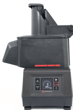
Food Processor CA-2V