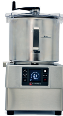
Food Processor Emulsifier