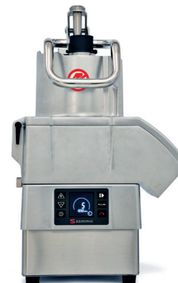
Food Processor CA-3V

CK Combi models available (emulsifier + veg slicer).