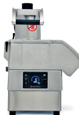
Food Processor CA-3V