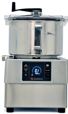
Food Processor Emulsifier