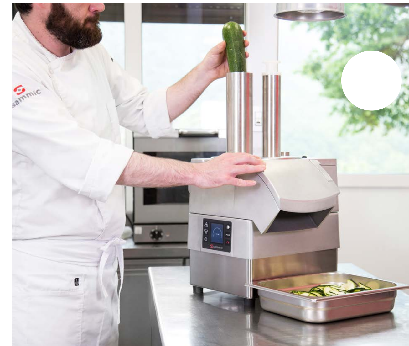
Long vegetable attachment